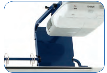
Projector Arm [patent pending] Supports EPSON Brightlink 450Wi Interactive Projector