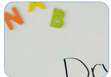
Magnetic Dry Erase Board Made of Porcelain Enamel, Dry Erase with a scratch resistant surface, offering a widescreen 16:10 projection surface.